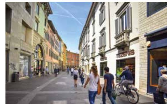
VIA XX SETTEMBRE