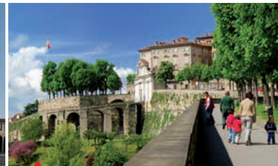
The Venetian walls