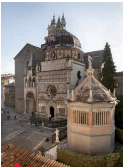
Baptistry, Colleoni Chapel and Basilica of Santa Maria Maggiore

Originally the residence of the Suardi-Colleoni families, the Palace of the Magistrate was