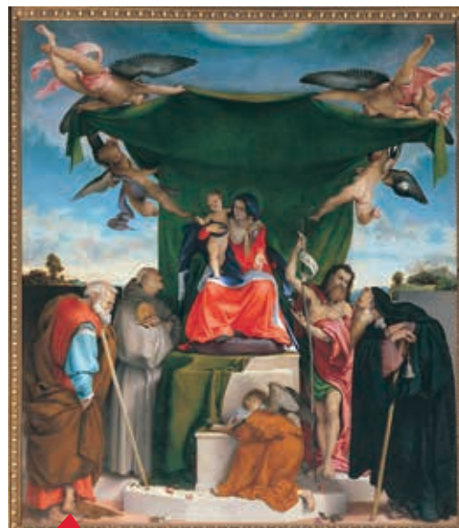
L. Lotto's altarpiece - S. Bernardino Church