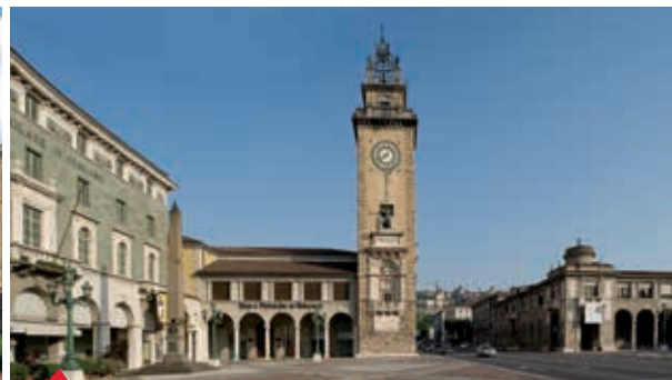
Piazza Vittorio Veneto