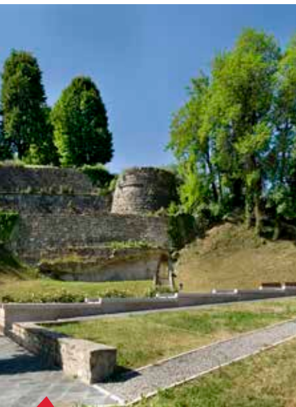
San Vigilio Castle