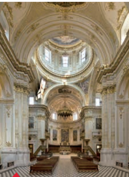
Duomo - interiors