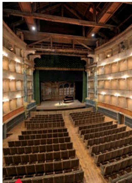
Teatro Sociale (Society Theatre)

Important discoveries made under the cathedral revealed the presence of two large churches that preceded it, and which traced the current church's outline: the Palaeo-Christian cathedral and the Romanesque cathedral dedicated to San Vincenzo. Both buildings were no doubt majestic and lavishly decorated as witnessed by the remains of the mosaic flooring dating back to the 6th century and 13th century frescoes, which can now be toured in the Cathedral's Museum and Treasure. In the second half of the 1400s, the decision to build the current Duomo was made and renowned architect Filarete contributed to the initial phase. Completed at the end of the 1600s, the church was dedicated to Saint Alexander. The cathedral, which holds works by Gian Battista Tiepolo, Giovan Battista Moroni, Sebastiano Ricci and Andrea Previtali, was completed only in the 19th century with the realisation of the cupola, whereas the façade dates back to 1866. Info Duomo: ph. +39 035 210223. www.cattedraledibergamo.it Museum Info: ph. +39 035 248772 www.fondazionebernareggi.it