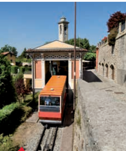
San Vigilio Funicular