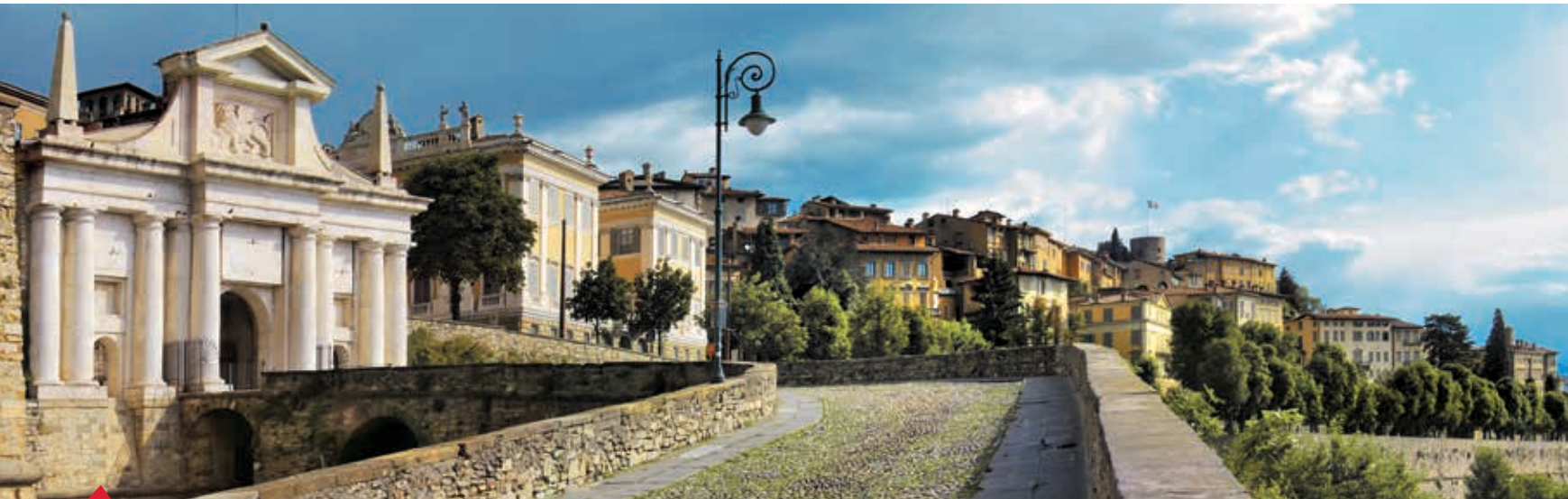
The Walls and Gate St. Giacomo

Considered one of the oldest Lombard communal buildings (12th century), the palace consists of a single imposing "hall of trusses", resting on a base of porticoes, accessed by a great staircase flanking the Campanone (Civic Tower). It was originally used as a council room, then as premises of the court of justice, a theatre and then library. The colonnade beneath the old town hall acts almost as a filter between Piazza Vecchia, where civil power was concentrated, and the square of the Duomo (cathedral), symbol of episcopal power.