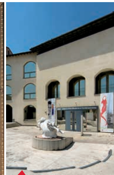
GAMEC - Entrance

in the 1930s, began collecting works of art, images of worship and objects for liturgical use. The museum is arranged in an itinerary with chapters and themes, offering the possibility of discovering these extraordinary testimonies that are intimately linked to the history of Bergamo and its Church.